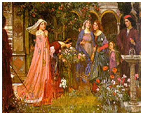
The Enchanted Garden by: J. W. Waterhouse